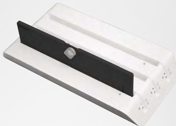
E14Ce battery and charging dock